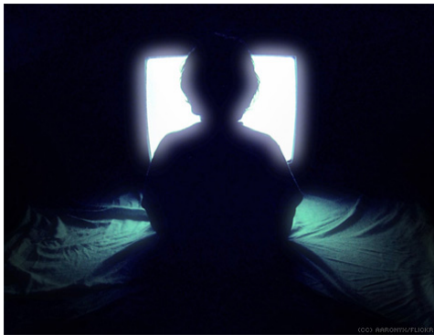
watch, to look